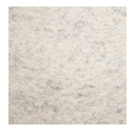
311 WOOL WHITE