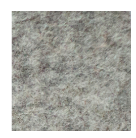
381 Concrete grey