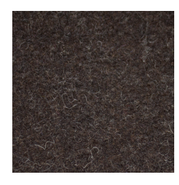
371 BURNT OAK